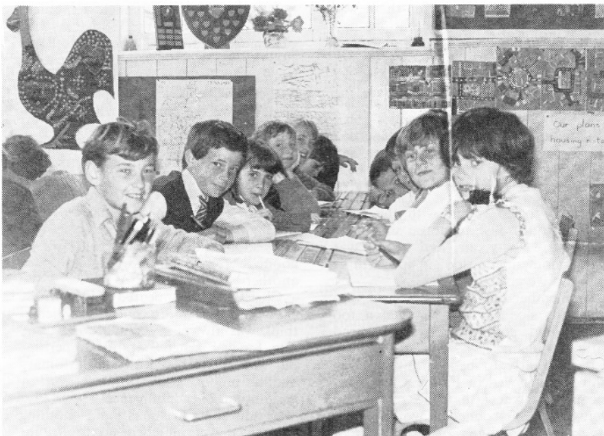
Some of the children of Rocklands county primary school.